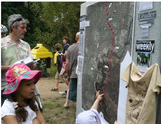
The Friends of Banyule with a display showing the proposed freeway route