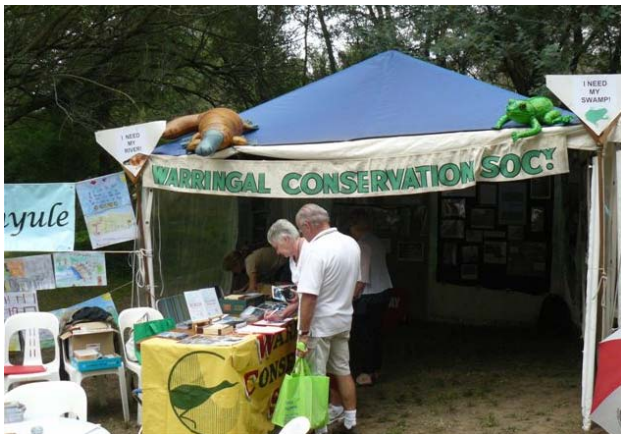
The WCS Tent at the festival